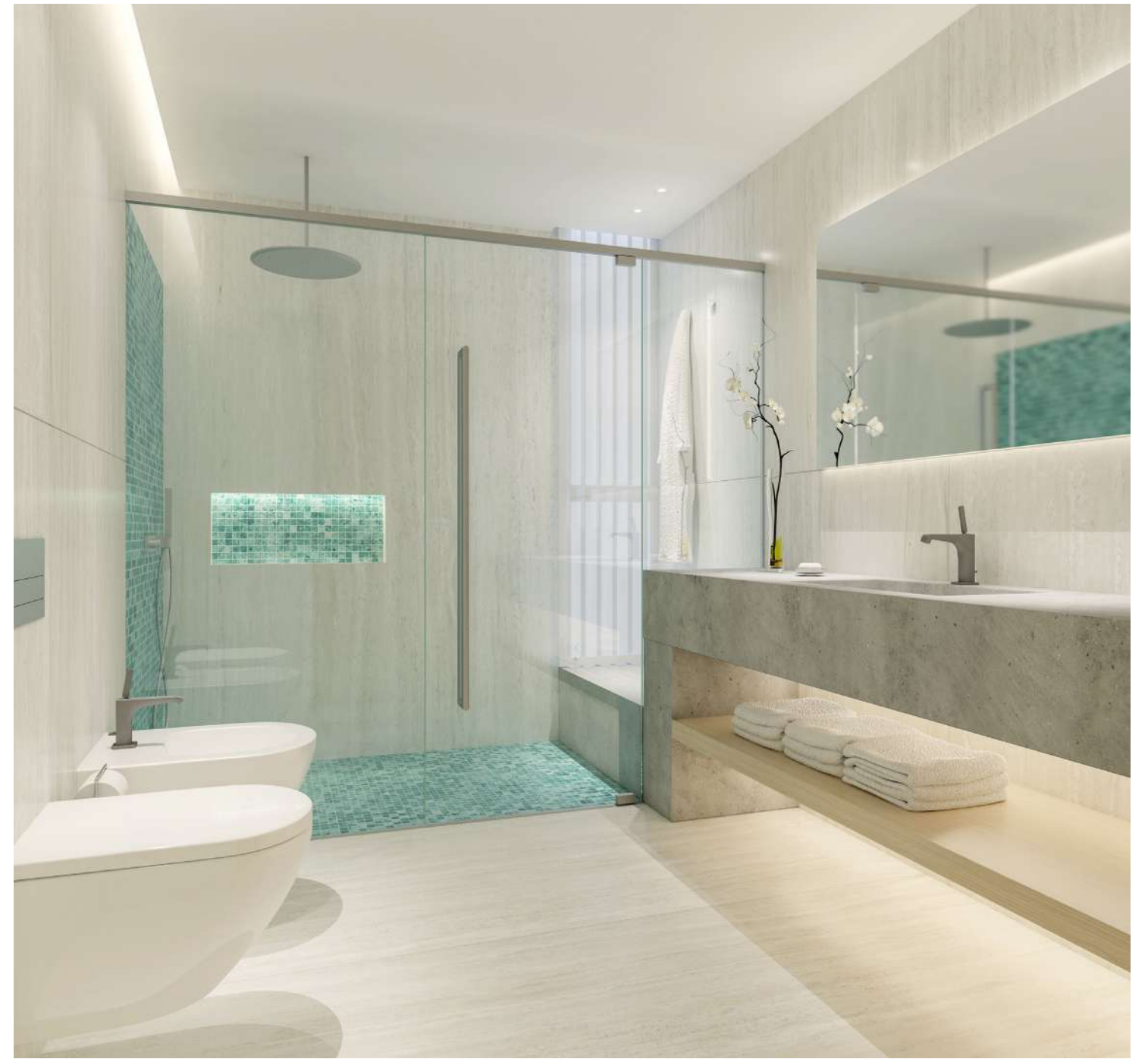
The neutral palette exudes a simple sophistication that highlights the luxurious finishing and ensures comfort and relaxation.