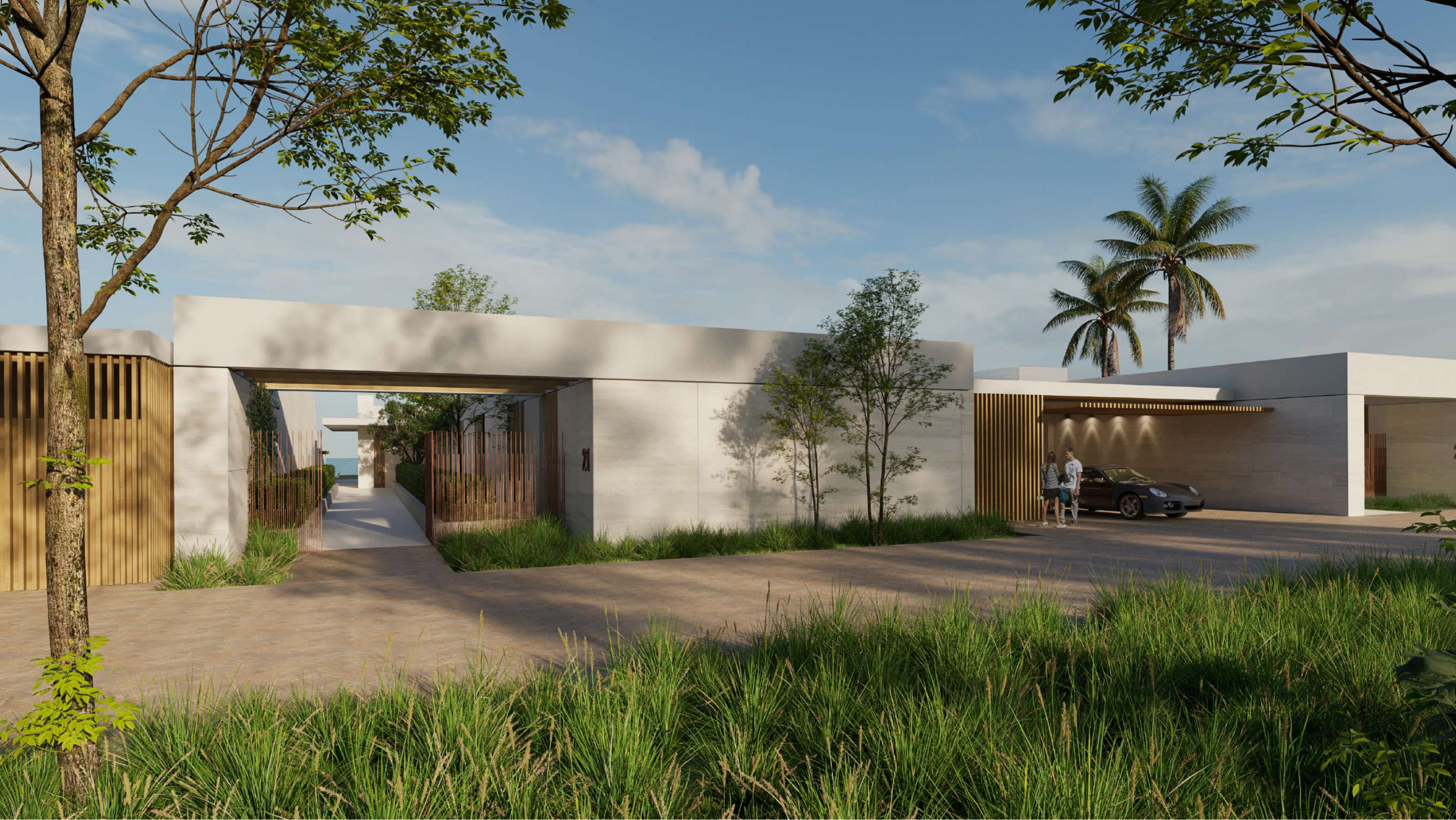
Planted verges alongside pedestrian-friendly roads lend a lush resort-style character to the beachfront community.