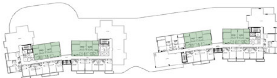
10 th Floor