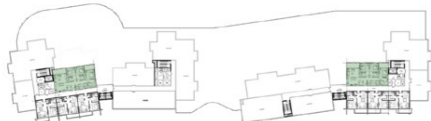
11 th Floor