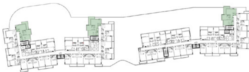
2 nd - 9 th Floor