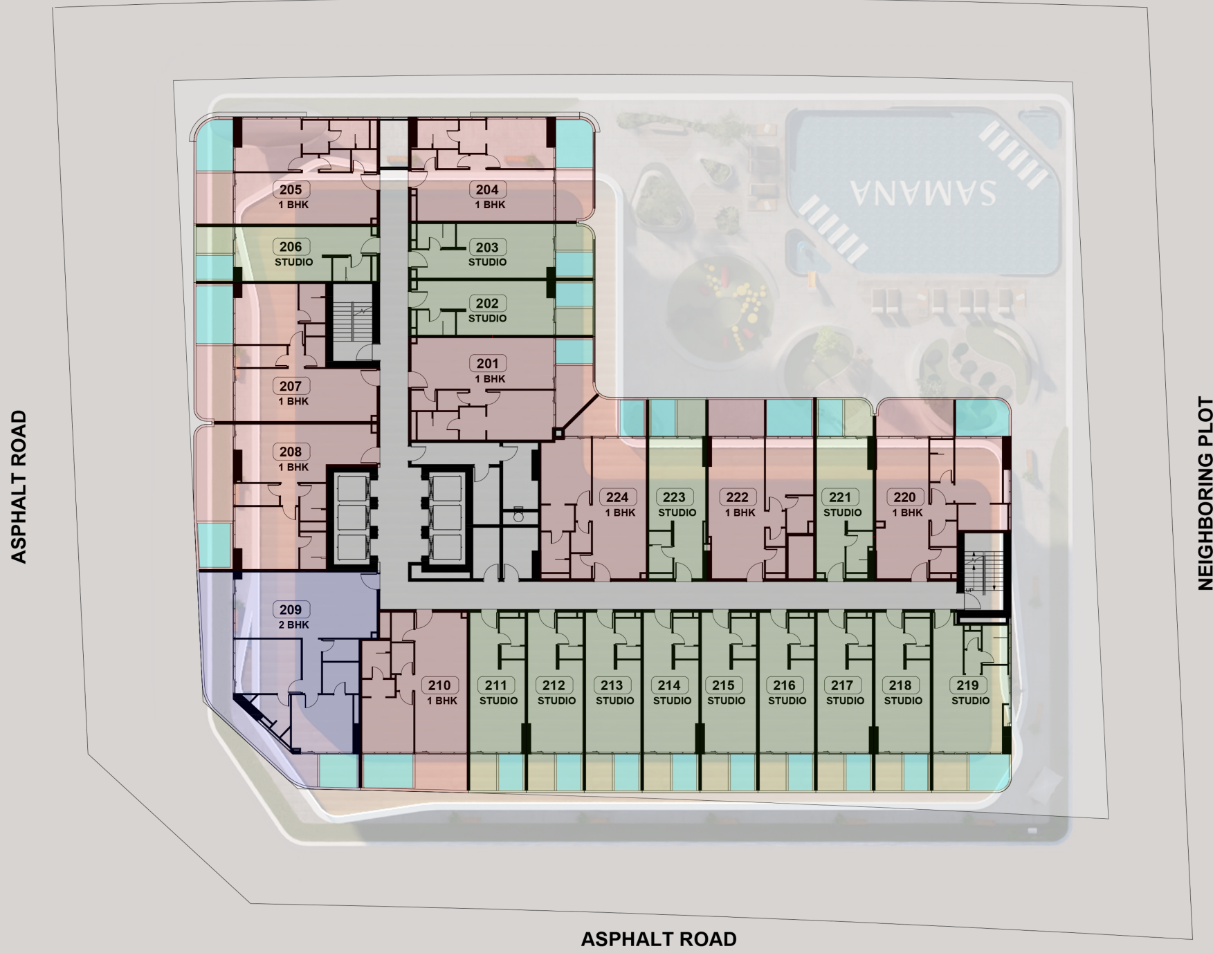
TYPICAL FLOOR - 2,3,4,7,8,9, 12,13,14, 17,18,19 PLAN