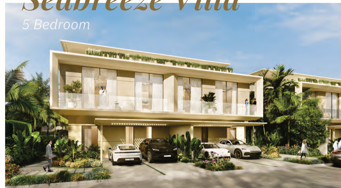
Ground Floor First Floor Second Floor