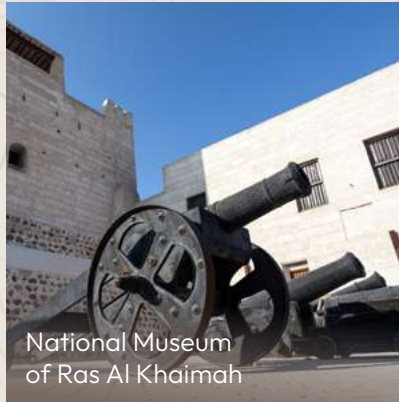
National Museum of Ras Al Khaimah