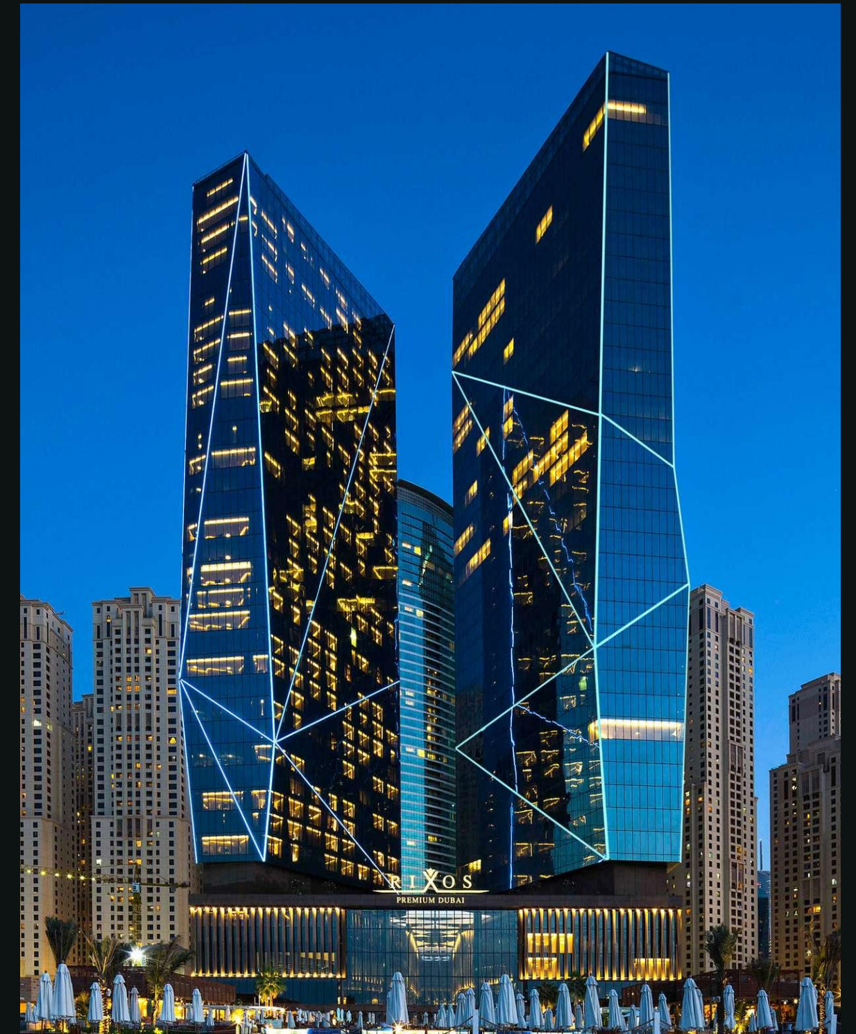
RIXOS PREMIUM, DUBAI JBR