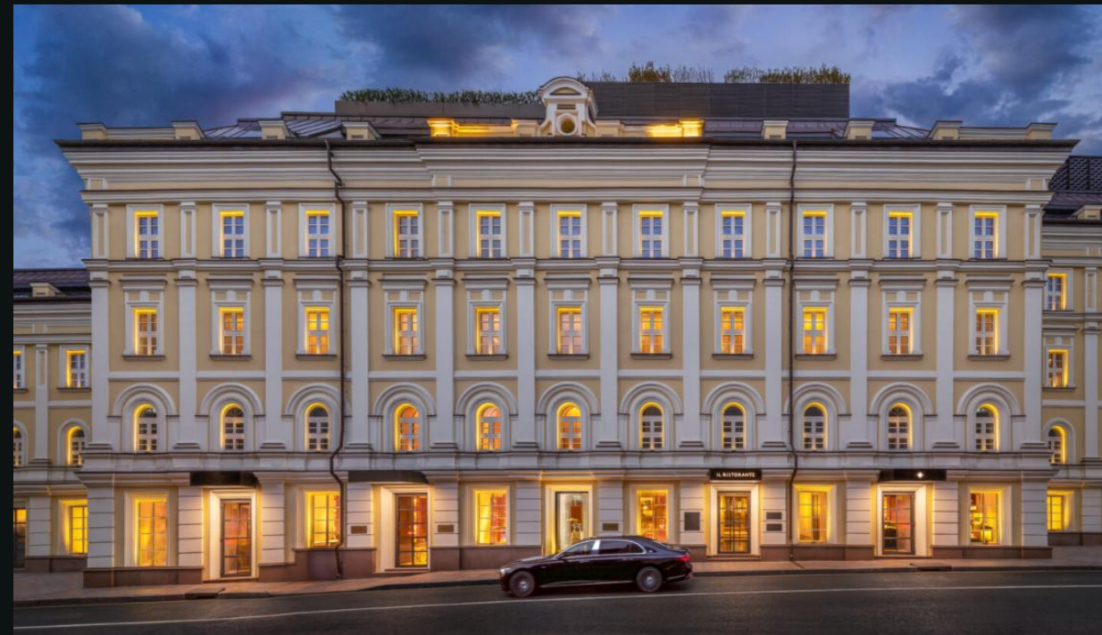
BVLGARI RESIDENCE, MOSCOW