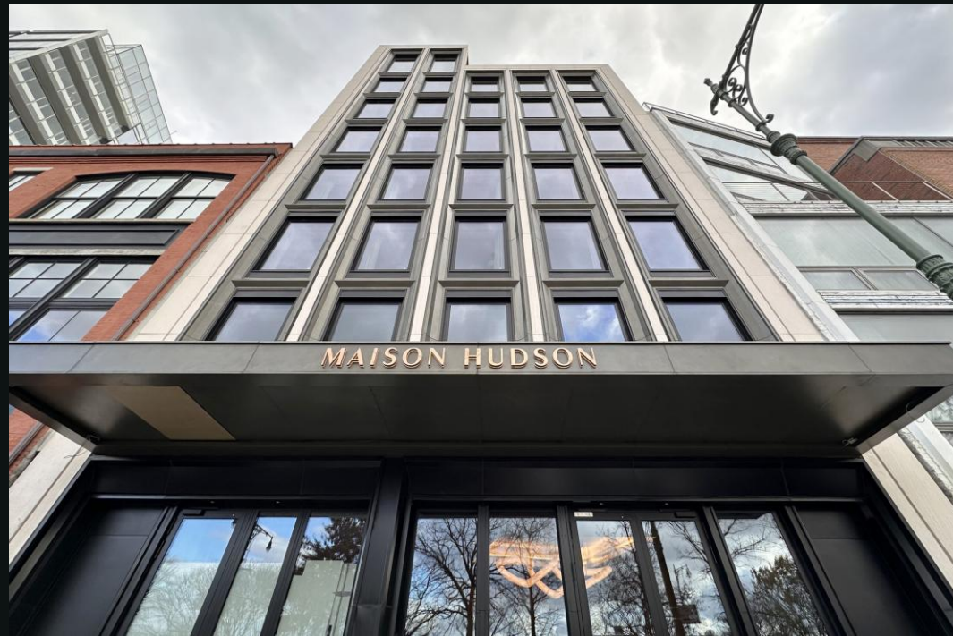
MAISON HUDSON, NEW YORK