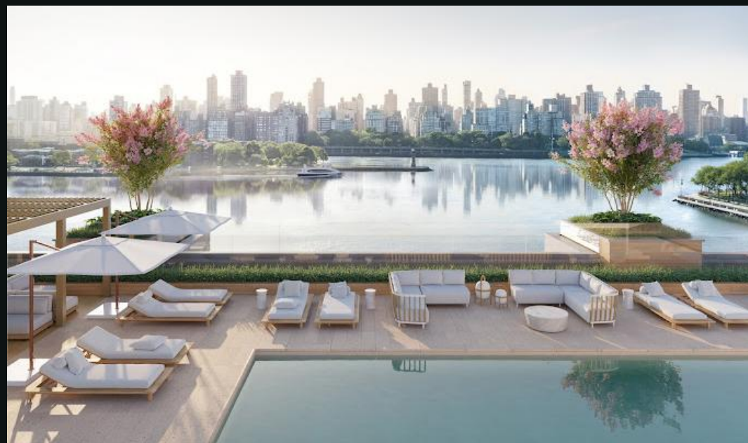
ASTORIA WEST, NEW YORK