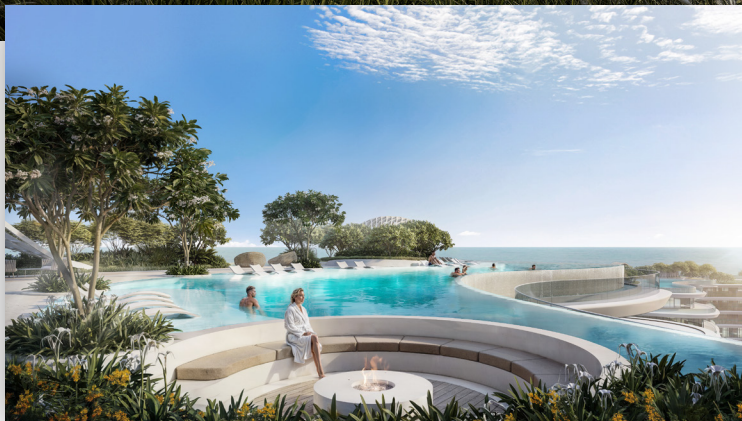
Skydeck at La Mazzoni