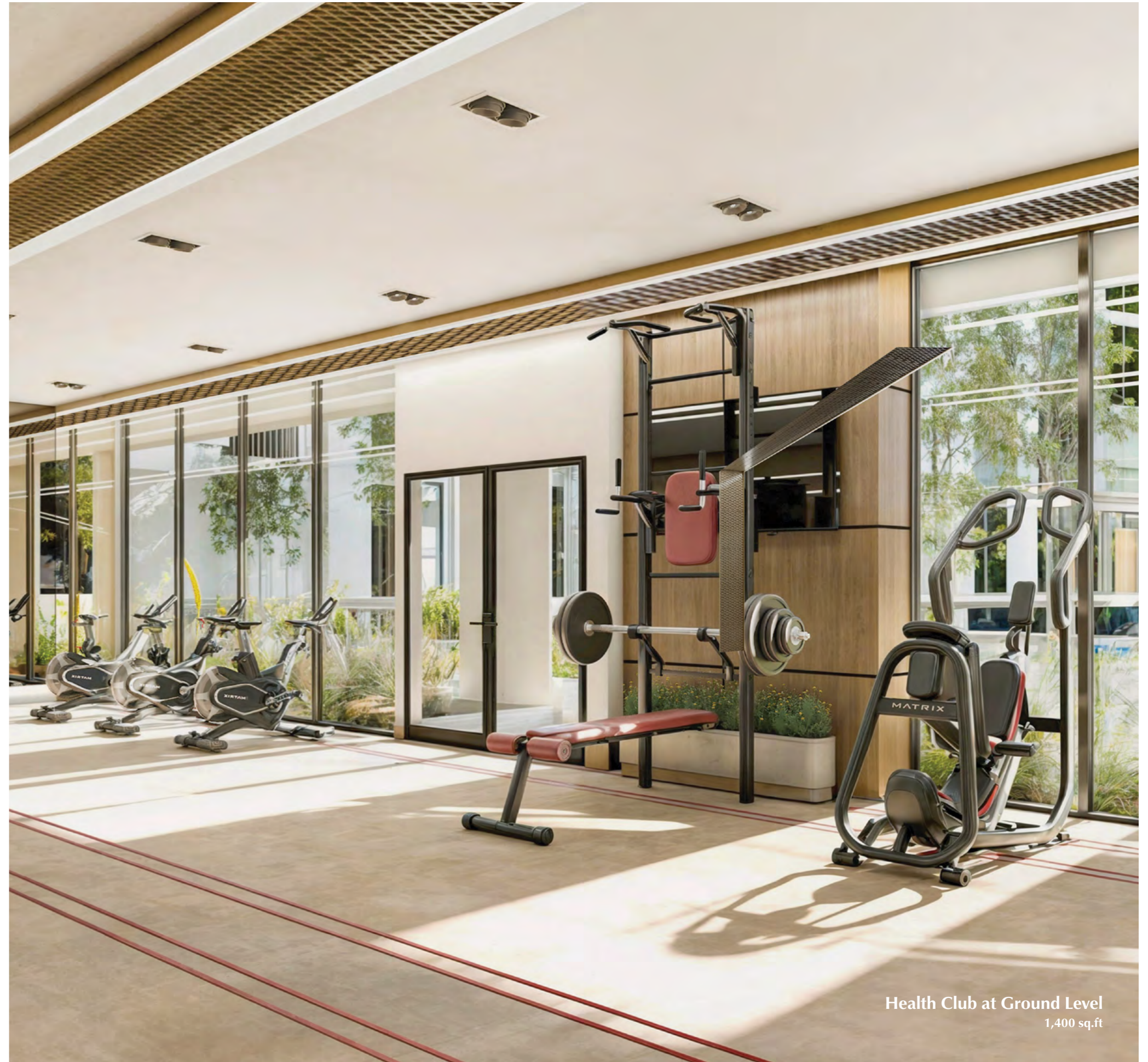
Health Club at Ground Level 1,400 sq.ft