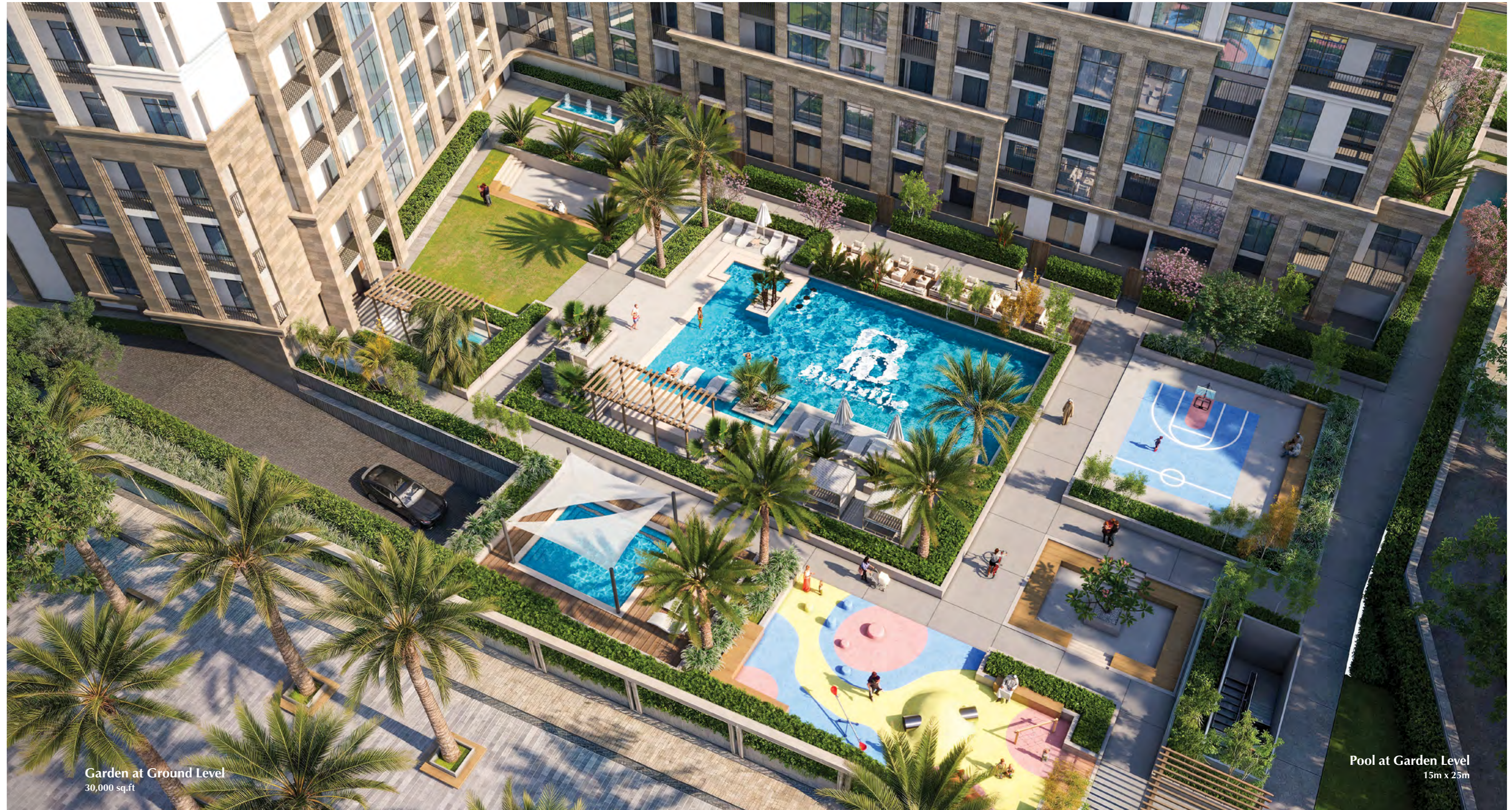
Garden at Ground Level 30,000 sq.ft