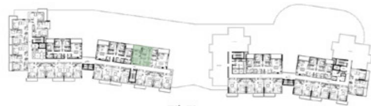
7 th Floor