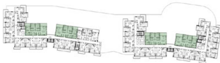
2 nd Floor- 6 th Floor