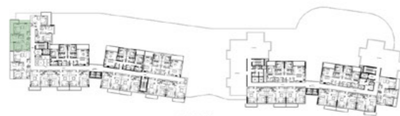
7 th Floor