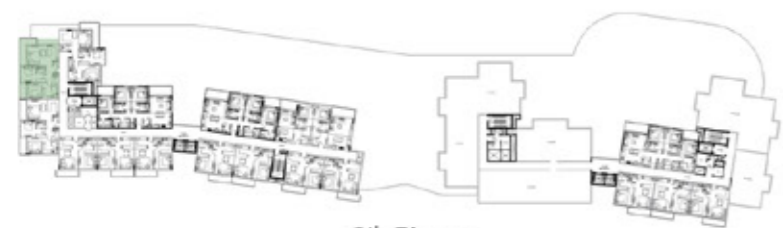
8 th Floor