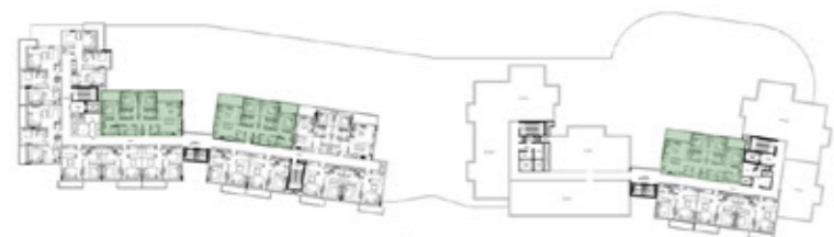
8 th Floor