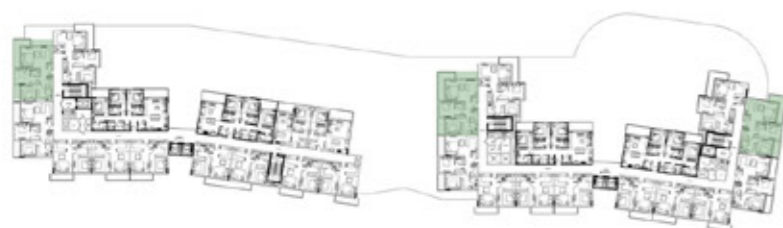
2 nd Floor- 6 th Floor