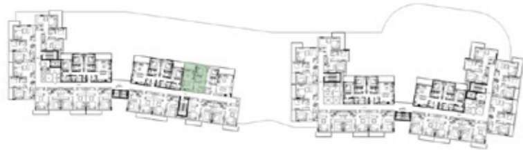
2 nd Floor- 6 th Floor