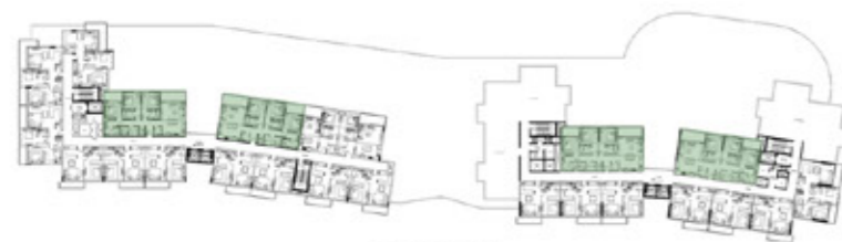
7 th Floor